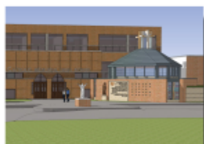
Main entrance with the new Chapel addition and the Memorial Wall.