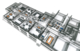
Southwest wing renovated to become the Innovation Wing