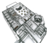
Renovated Academic Resource Center (ARC) including: